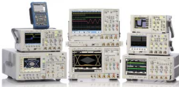
Agilent Technologies Oscilloscopes

Microsoft is a U.S. registered trademark of Microsoft Corporation.