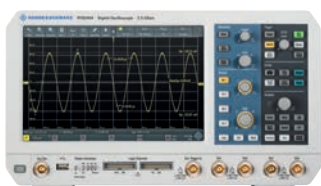
R&S®RTB2000 300 MHz oscilloscope 38% discount