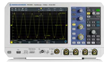
R&S®RTA4004 1 GHz oscilloscope 57% discount