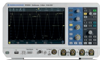
R&S®RTM3000 500 MHz oscilloscope 47% discount