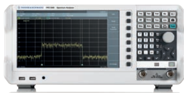
R&S®FPC1500 3 GHz spectrum analyzer 46% discount