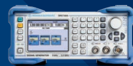
R&S®SMC100A 3.2 GHz signal generator 9% discount