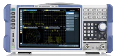
R&S®ZNL6 6 GHz 3-in-1 vector network analyzer 10% discount